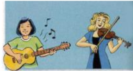
4. play the guitar/ the violin