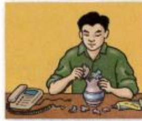
12. fix things