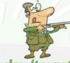
clay (target) shooting