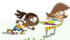
athletics (track and field)