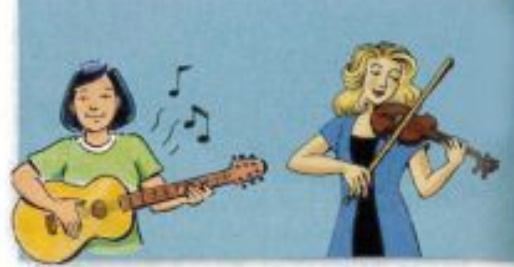
4. play the guitar/ the violin