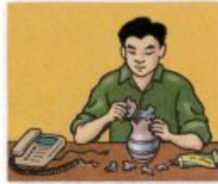
12. fix things