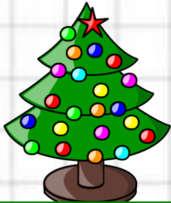
A Christmas tree

Usamos A con los sustantivos que inician con sonido de consonante.