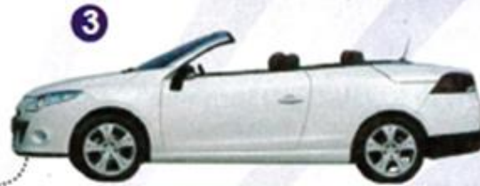
3 a convertible