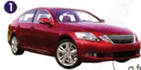
1 a full-size sedan