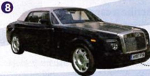
8 a luxury car