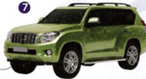
7 an SUV