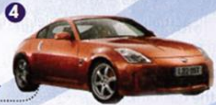
4 a sports car