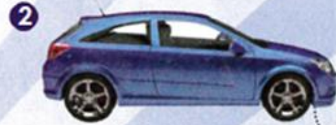
2 a compact car