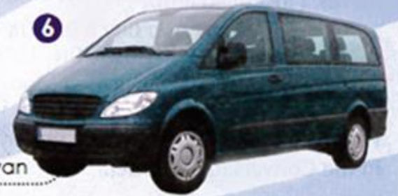
6 a minivan / a van