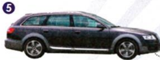
5 a station wagon