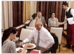
2. a restaurant