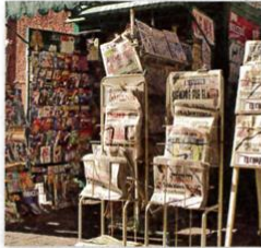
5. a newsstand