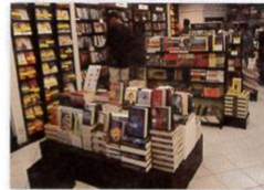
6. a bookstore

Exercise 1. Translate to Spanish the vocabulary above (Traduce al español el vocabulario de arriba).