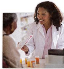
1. a pharmacy