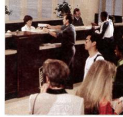
3. a bank