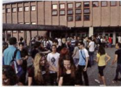
4. a school