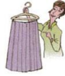
3. This skirt