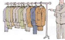
7. These suits