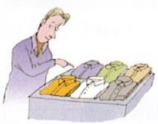
5. These shirts