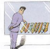
8. Those ties

GRAMMAR - The Present Simple tense: affirmative statements with "like", "want", "need" and "have".